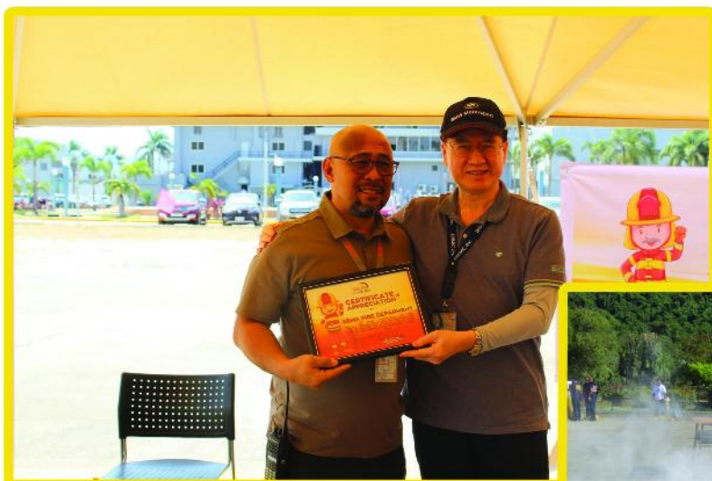
Tong Lung (Phils.) Metal Industry Co., Inc. Fire Extinguisher Relay Event- Champion Fire Hose Relay Event - Champion Tug of War Event - Champion